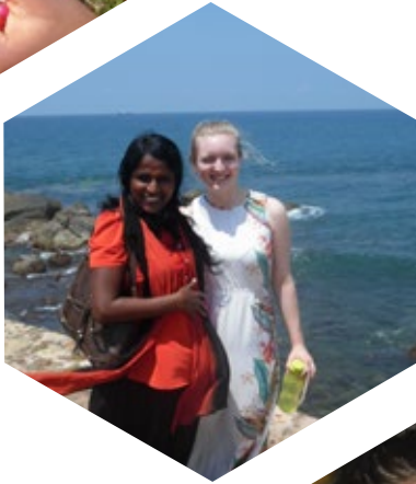
Women empowerment program