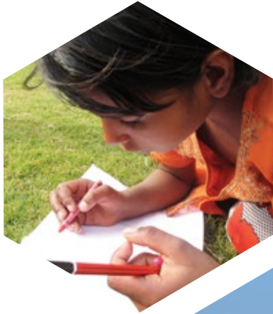
Teaching at schools for underprivileged children

There are several local projects which have requested volunteers to help them improve their work. Broadly, the type of activities available are