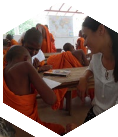
Educating Buddhist Monks