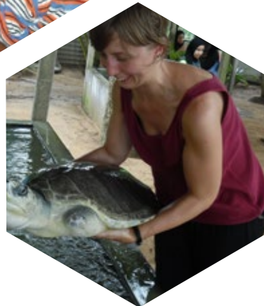
Turtle conservation work

# The turtle conservation project can be done for durations as short as a week and is organised differently. If you are interested in this project, then ask us for more details.