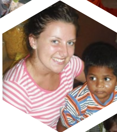
Child Care at kindergartens or for pre-school children